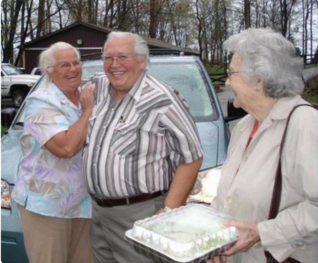
From a visit to Mom and us